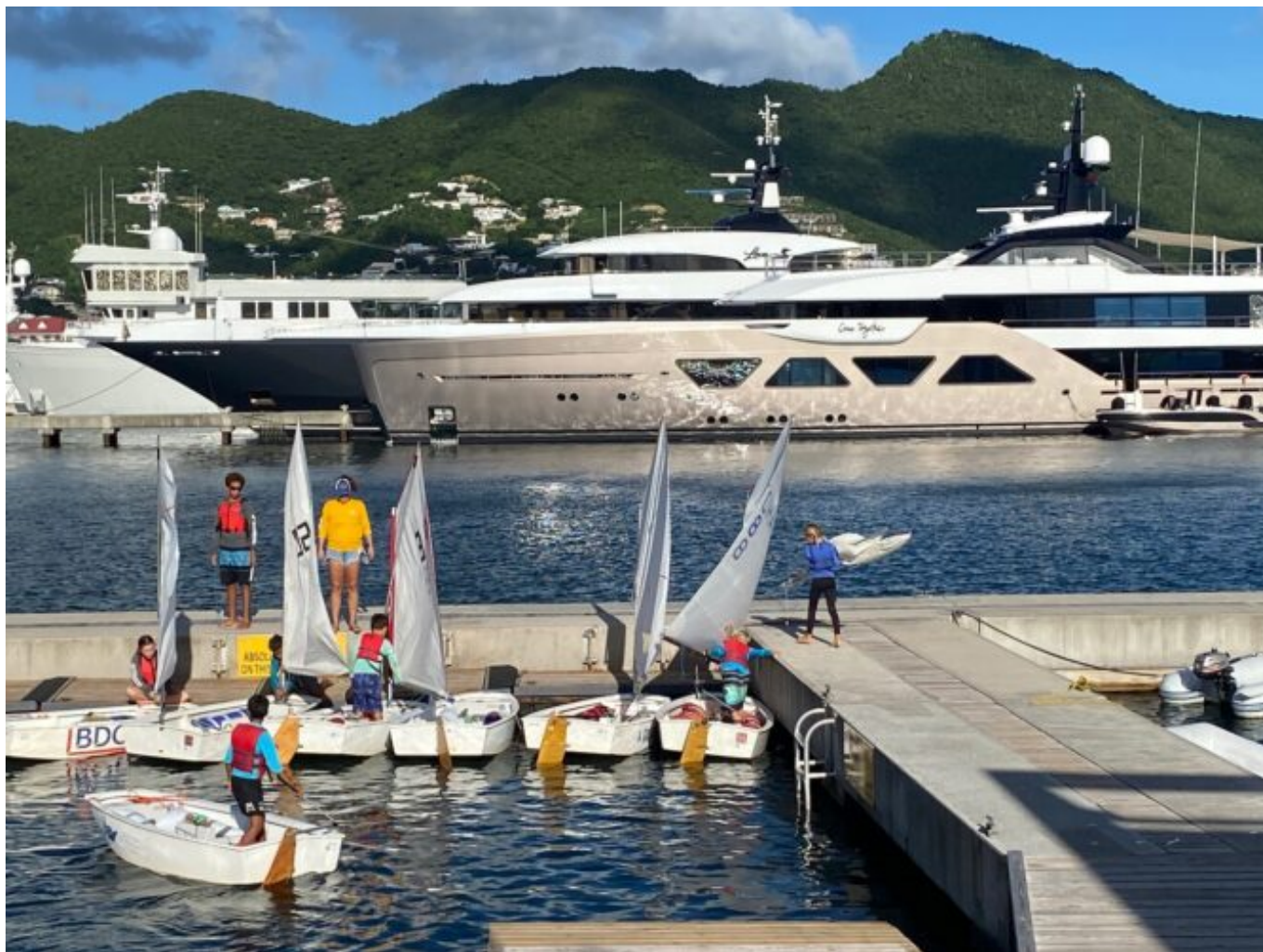
Mega yachts in the St. Marten yacht club

Three weeks into our voyage, an emergency forced the owners to return to their home port, and we sadly flew back to Vancouver from the Virgin Islands. Lessons learned? Be flexible and expect the unexpected. If you wish to sail and hang out in boater bars, choose the Eastern Caribbean. For both sailing and a taste of other cultures, I'd go farther west.