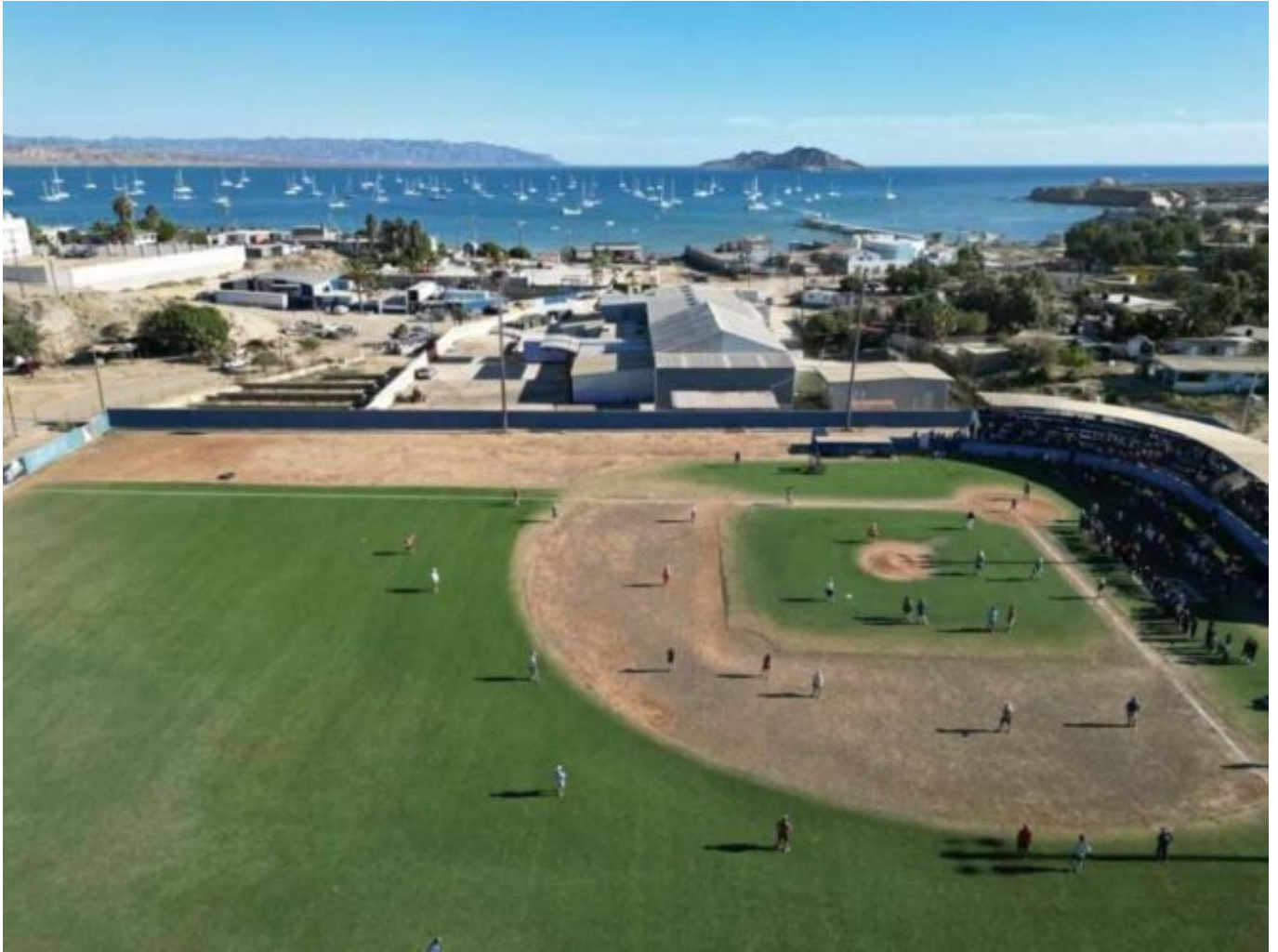
Baseball field in Bahia Tortuga with the Baja Ha-Ha fleet in the background

On the second leg, we sailed Bear North well offshore (100 nm) looking for better wind. We did not find it, but to our amazement were visited by a blue whale. What a sight! We managed to arrive in Bahia Santa Maria after several days sailing in 8 to 12 knots. The large bay featured beautiful beaches. The local fishermen took the day off to ferry us through the surf to enjoy time ashore. The evening party was the main event, complete with a live band from La Paz, and a good time was had by all.