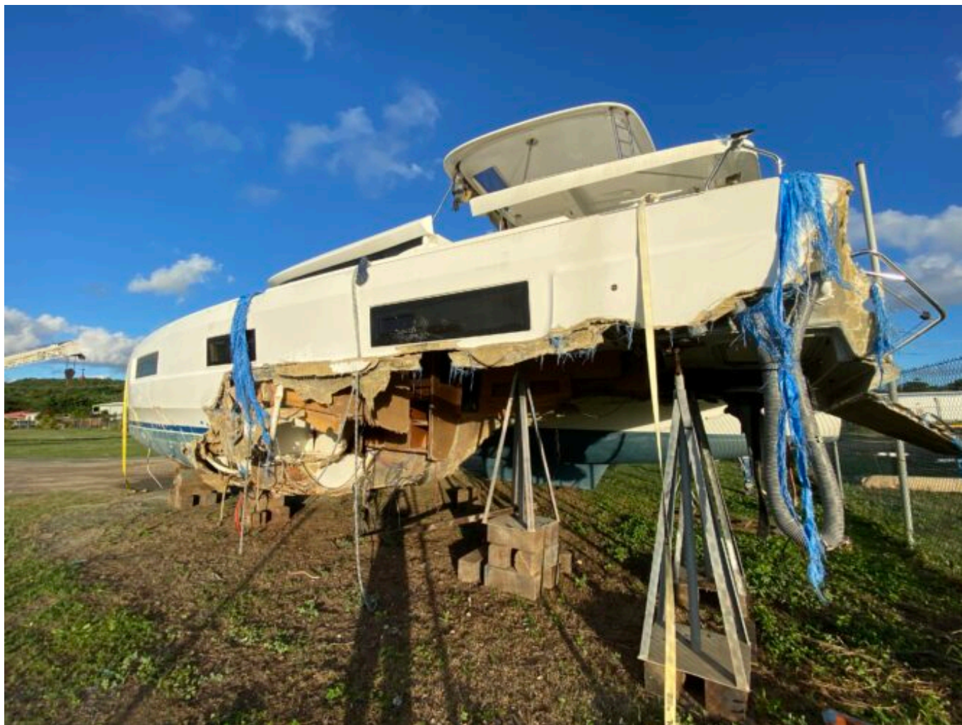
Hurricane damaged catamaran – a graveyard of dreams

P.S. If you're interested in crewing, there's a good article in the November 2023 issue of 48 North .