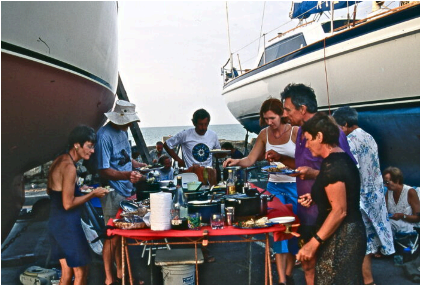
Christmas at the boatyard, Puerto Lucia, Ecuador, 2002.

Recently, when we were in a complex of small apartments in Maui, we were invited to join other guests on the lawn on a Thursday at 1730. The suggestion was “bring your own drink and a pupu (appetizer) to share and make some new friends.”