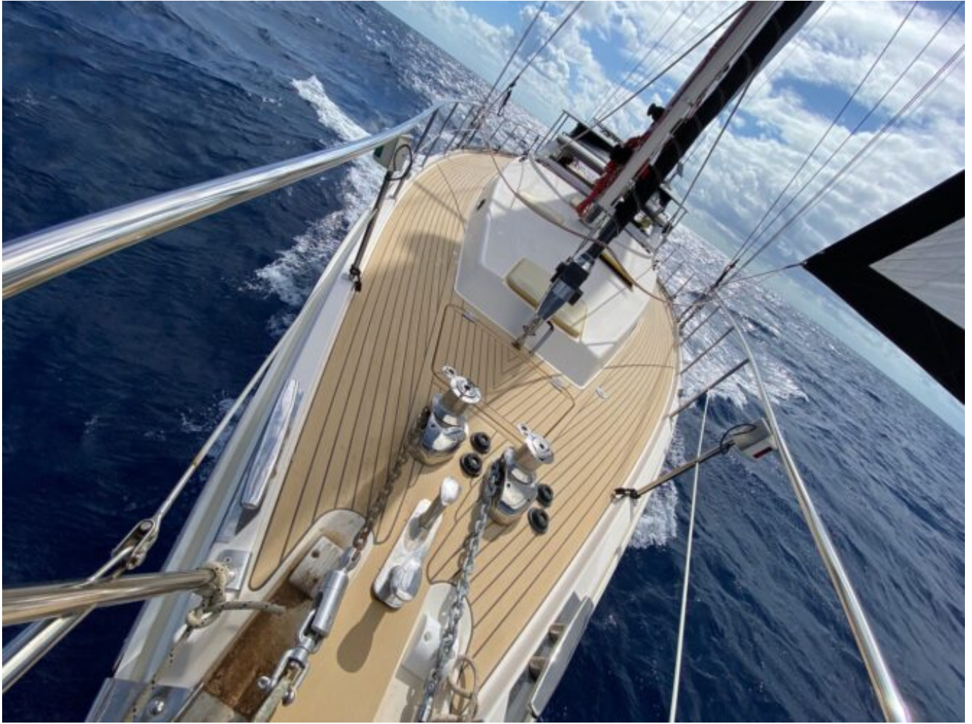
Amel 54: Lovely but high maintenance

Their yacht was an Amel 54, kept in immaculate condition. They have been living aboard for several years, cruising through the Caribbean, so had perfected procedures for everything. The French-built ketch is renowned as the Rolls Royce of cruising boats, with all-electric mod-cons: water maker; three fridges; Starlink; winches; alarm systems; roller furling; even an induction stove and a BBQ. Acres of solar, a genset, and a massive lithium battery bank that feeds the boat's appetite for power. Amels, not surprisingly, have a reputation for high maintenance. Every couple of days, something required tweaking (definition of cruising: "fixing things in exotic places").