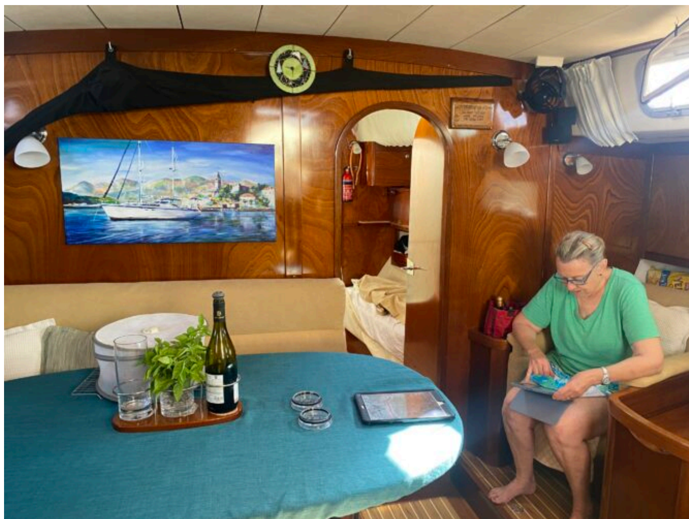
The cherrywood gleams in the interior of the salon

We island-hopped north with two uneventful overnight passages under jib and mizzen. Weather was a perfect 28 degrees in both air and sea, with 10-15 knot breezes. Most days were spent on anchor or a mooring buoy, swimming off the stern, cleaning the boat, or wandering about the shoreline. (Starlink was a godsend, but only available when stationary.) The harbours are packed with charter catamarans and luxury yachts. Several small ports also cater to massive cruise ships. All make it an expensive place to eat, drink, and live. It is difficult to understand how locals get by.