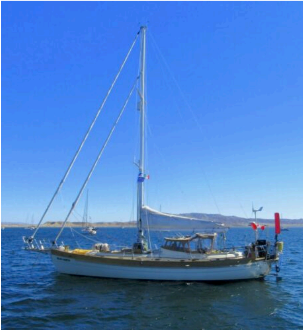
Bear North at anchor in

miscellaneous required documents and forms. Ensenada is on the cruise ship circuit and offers numerous restaurants as well as exceptional wine tours.