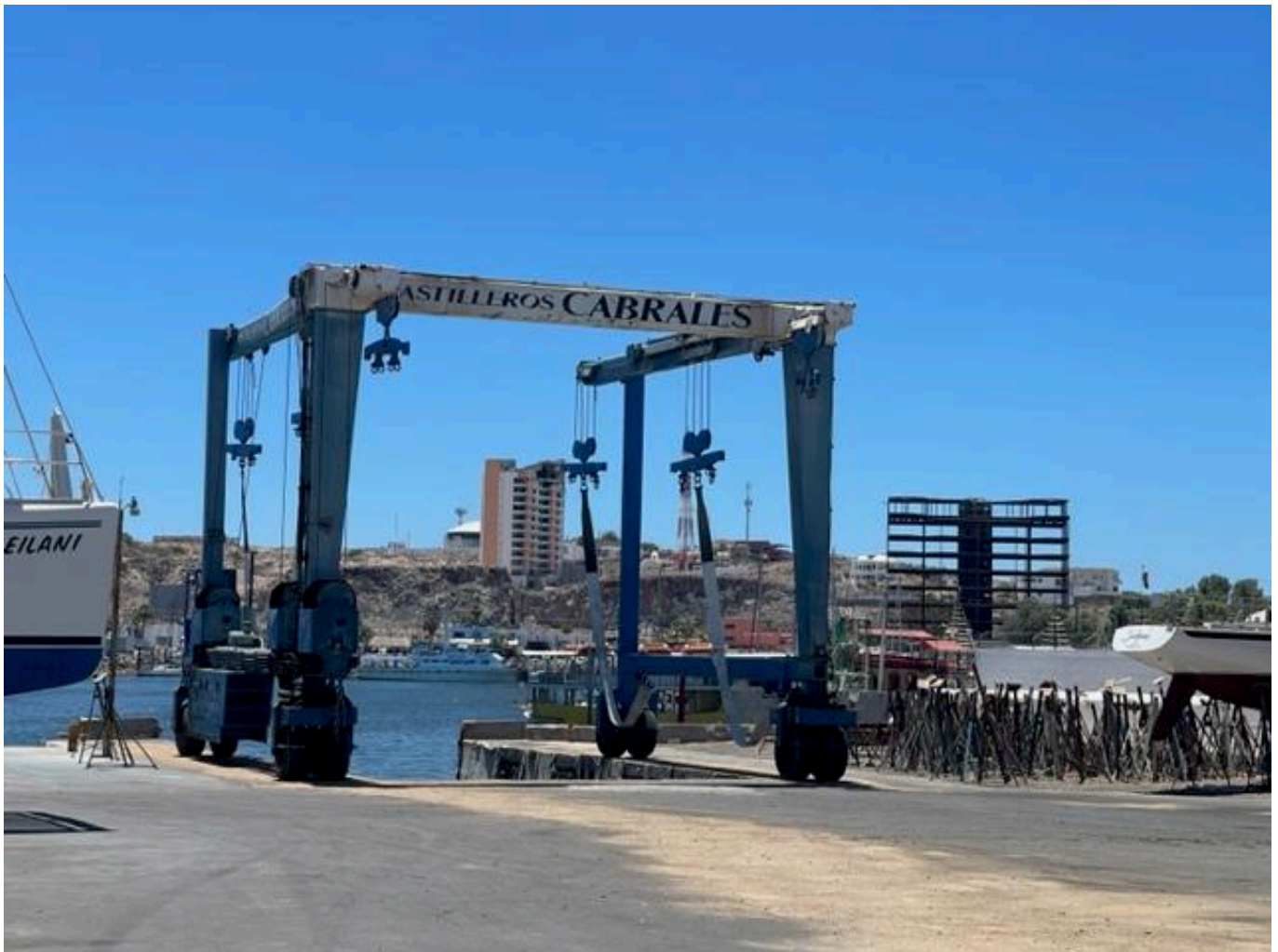
Cabrales 150 ton ship marine lift

The US threat to boycott catches from the Sea of Cortez punished all local commercial fishermen and limited fishing activities in the area. With the impending US embargo affecting the entire industry, Salvador III started a website promoting the boat yard and its hurricane safe location to pleasure crafts from across the globe. What started with the first cruising vessel in June 2012, increased to a record number of more than 140 boats this season, with the majority (80%) of clients coming from the US and Canada, followed by European, Australians, and other countries.